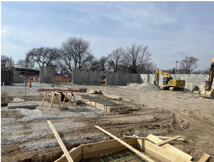
Concrete footing pour for South gymnasium wall Area C2