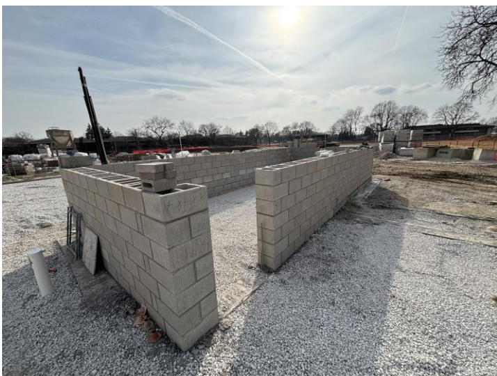
Area C2 Stairwell #2 initial CMU install