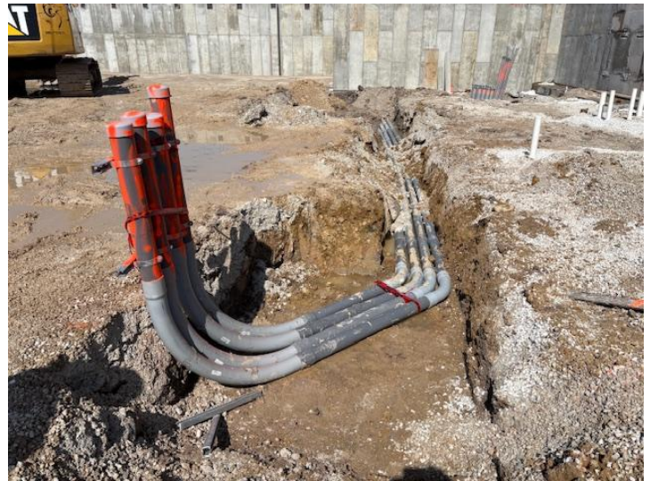
Area A2 underslab duct package for main data room