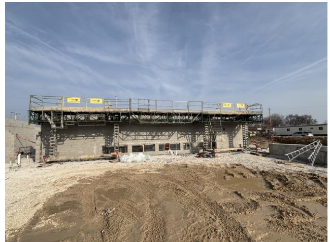
Hydro Mobile setup for Pool Storage CMU wall / East wall of Pool