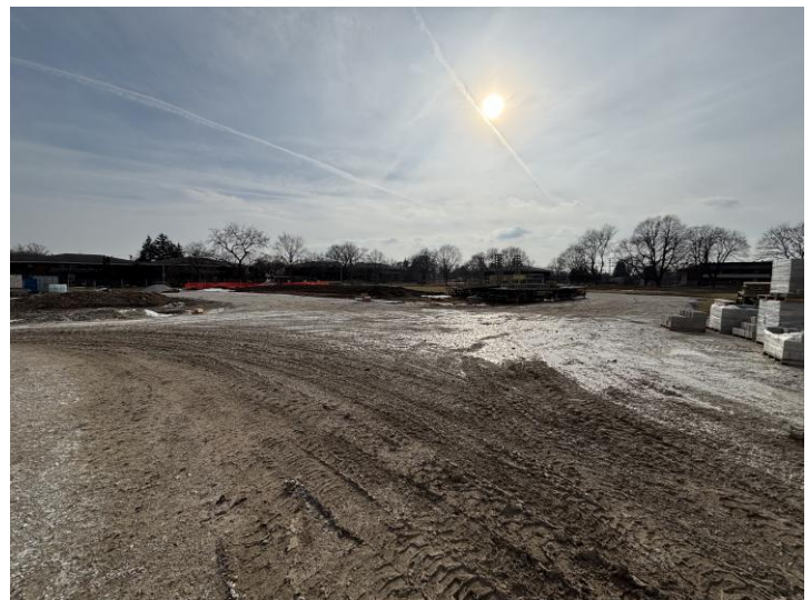
West crane road installed for deliveries of structural steel, precast and subcontractor access to playfield